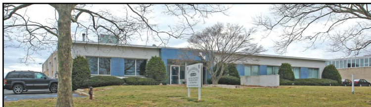
129 Oser Ave., Hauppauge

10 x 10 office. After three years, Alliance Real Estate has become a major player in the commercial real estate industry. They have done this by building relationships and