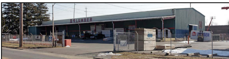
330 Moffett Blvd., Islip