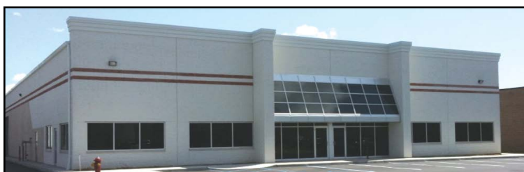
1591 Smithtown Ave., Bohemia

making the needs of their clients a priority.